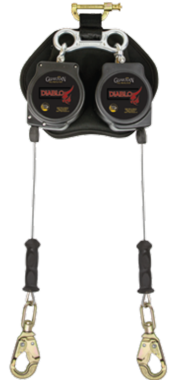
SHOWN: PART #11074

Several different types available (see next page)