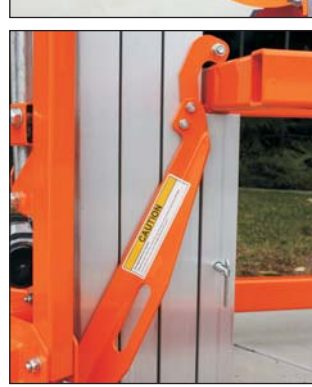
Hold down can be actuated when stabilizers are stowed.

Precision cast metal cable pulleys, folding leg slide pads, non-marking leg wheels, and Clear-Path™ foot clearance.